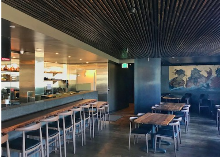
Energy-saving recessed LED lights highlight a menu of ramen, sushi and small plates

Roberts Electric teamed with Buestad Construction on Oakland's new Izakaya restaurant, Shinmai, an adaptation of traditional Japanese architecture. We worked closely with the owner, Buestad and the lighting designer to install a sophisticated lighting scheme that met the restaurant's unique design aesthetic--the backdrop for Shinmai's specialty menu of ramen, small plates, sushi and grilled items.