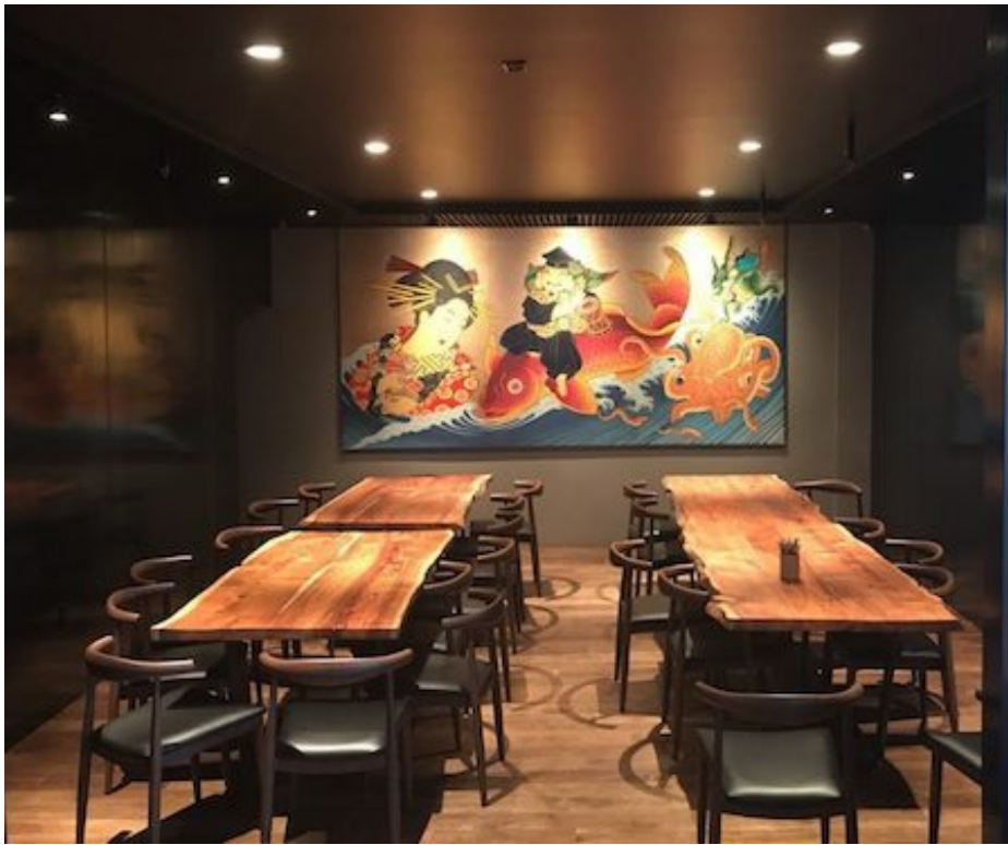
An additional row of track lighting provides more comprehensive illumination in this smaller dining area