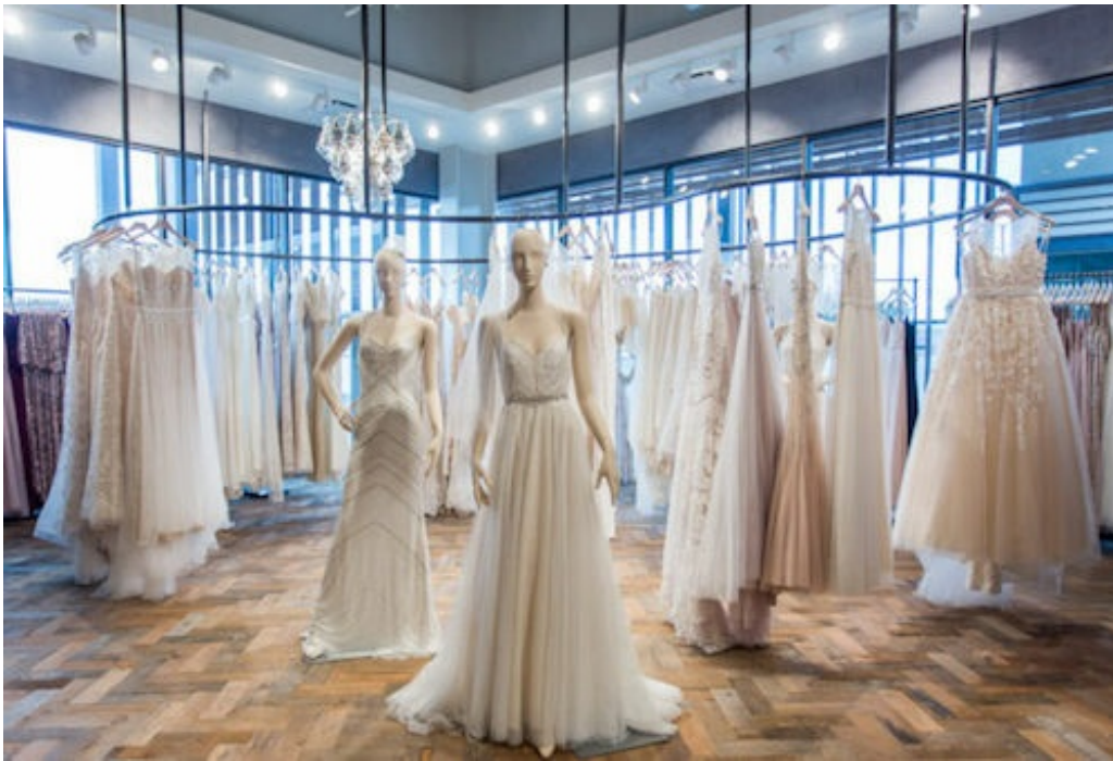
The new-concept store features a wedding boutique