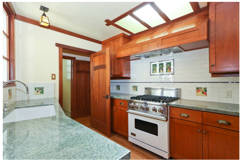
The stove's hood is mounted on the roof so the owners don't hear the sound of the fan when they cook