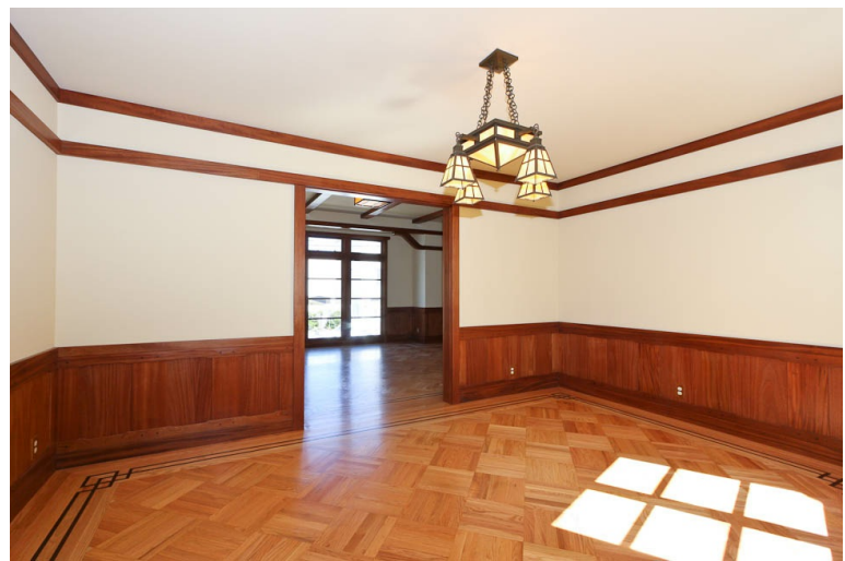
All of the rooms now have overhead lighting and new fixtures